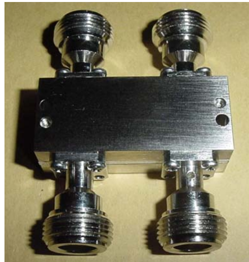
4 way coupler, 3, 6, 10, 20, 30 dB (others by request)